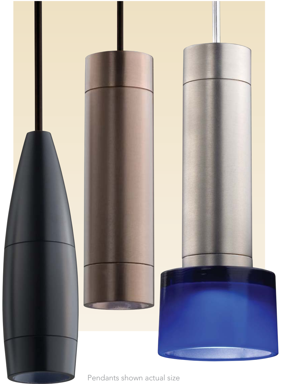
Pendants shown actual size

Energy efficient, maintenance free, miniature scale LED pendants optimized for downlighting over tables, countertops and cash wraps