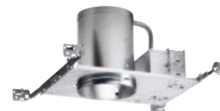
Compact Fluorescent PL642, ICPL632, ICPL626, ICPL/PL618, ICPL/PL613, ICPL/PL526, ICPL/PL518, ICPL/PL513