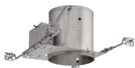
6" Universals IC2, TC2, IC21, IC22, IC23