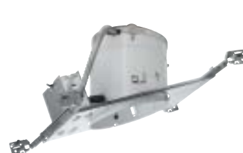
Sloped Ceiling IC926, TC926, IC928, TC928