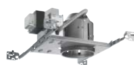
Low Voltage IC44N, TC44, TC45, TC46, TC47