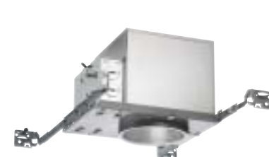
4" Universals IC1, IC1P, TC1