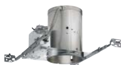
5" Universals IC20, TC20